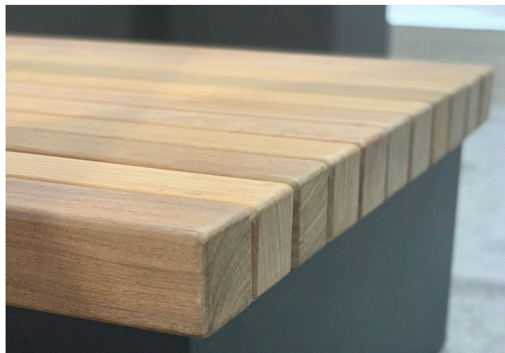
FF LOUNGER SHOWING 4X4 POST SEAT

_____ Thermally Modified Option _____ Ipe (Exotic)