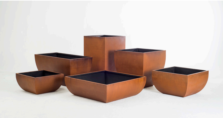
Example: Typical Pre-Weathered Finish