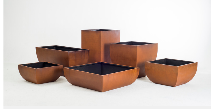
Example: Typical Pre-Weathered Finish

4. Purchasers should exercise caution in placement as units may leach onto adjacent surfaces until fully weathered and self sealed.